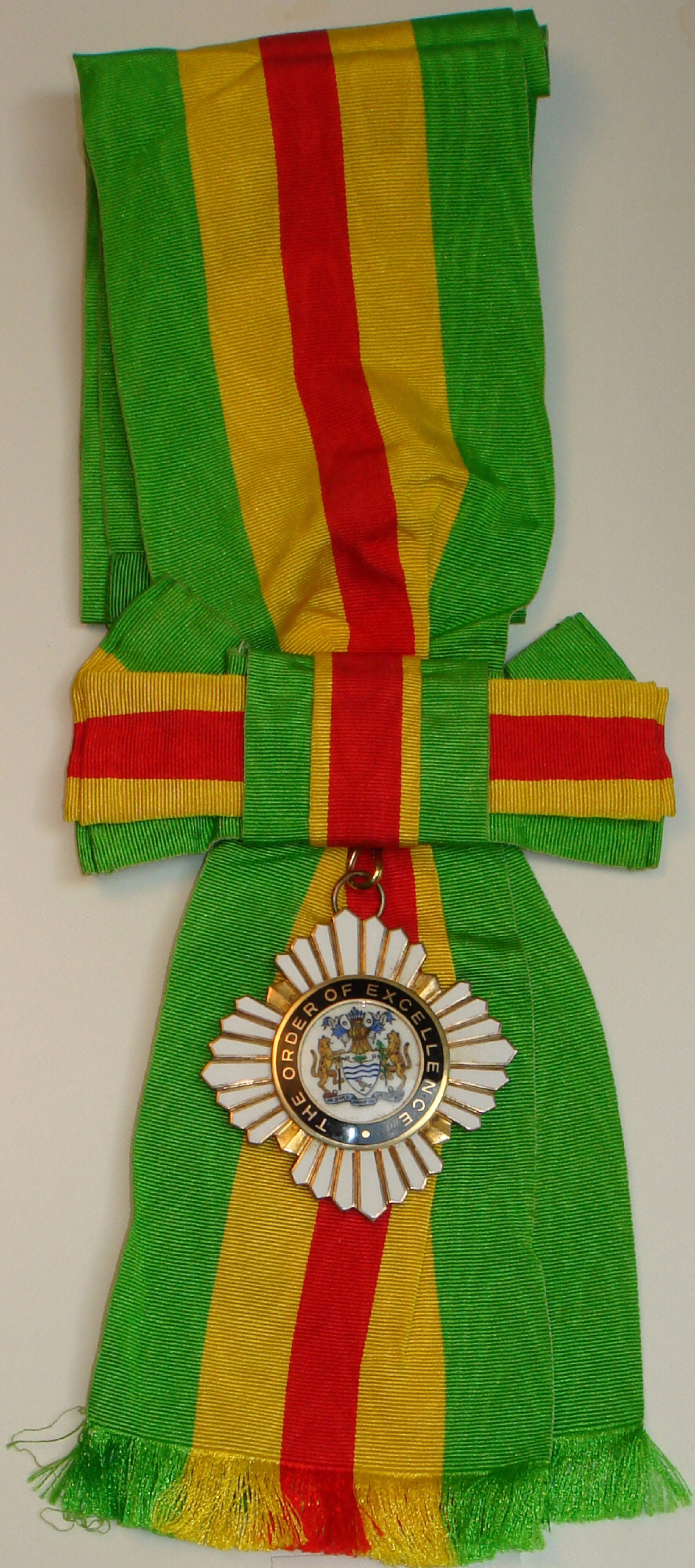
Order of Excellence GUYANA OE