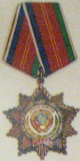
Order of Friendship with the People USSR