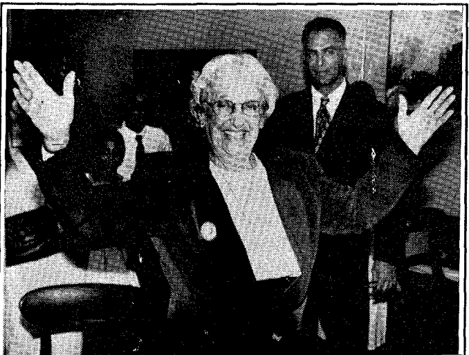
"The People have won... Guyana has won!"