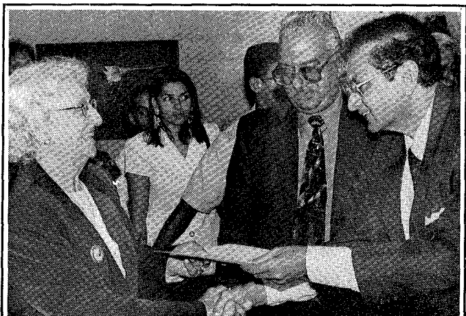
Her Excellency Janet Jagan, OE, was sworn-in as Guyana's first woman President on Friday, December 19, 1997.