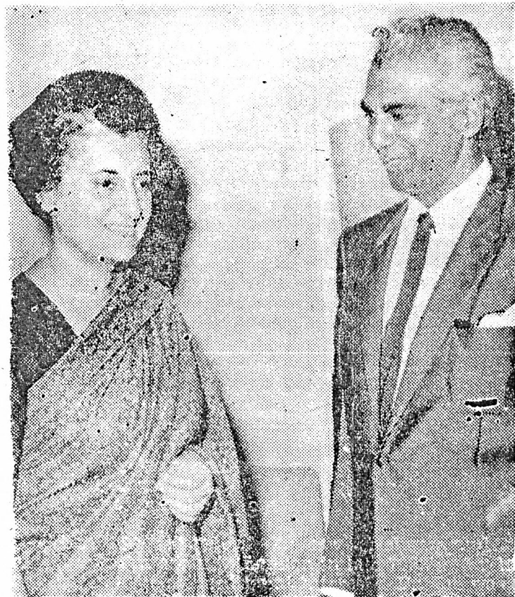
In the early 1970s, during a spate of visits to Guyana by prominent world personalities, Indian Prime Minister Indira Gandhi came. She was warmly welcomed by the Guyanese people. In this picture, she is seen sharing pleasant comments with PPP Leader Cheddi Jagan.

very exceptional circumstances, it is an immoral and shortsighted conception. 17