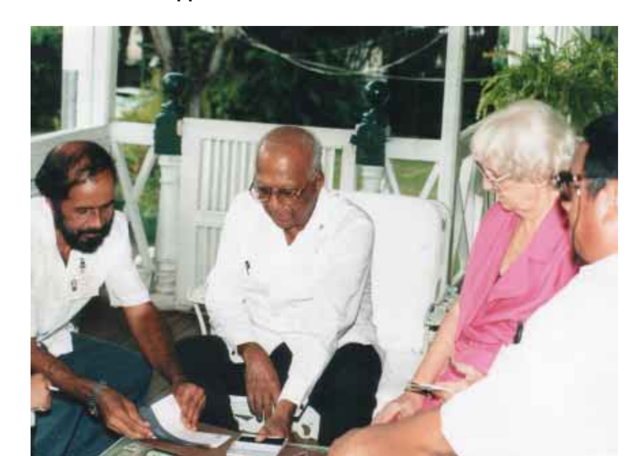
On November 8, 1996 President and Mrs. Jagan completed national registration for the 1997 elections.

Despite his long years in the opposition before 1992, Cheddi Jagan maintained his stature as an international figure of renown. Following his Presidential victory, he firmly established himself as a world statesman, and his ideas for a New Global Human Order are winning support in all corners of the world. His proposal for a Regional Integration Fund for the smaller economies of the Americas has already won the total support of the CARICOM and Central American nations.