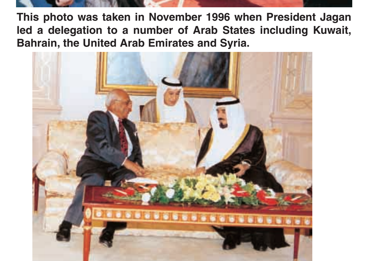
This photo was taken in November 1996 when President Jagan led a delegation to a number of Arab States including Kuwait, Bahrain, the United Arab Emirates and Syria.