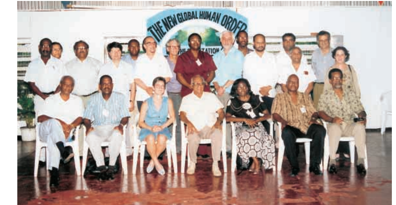
This photo was taken in August 1996 during the International Conference on a New Global Human Order held in Guyana and organized by President Jagan.

The outpouring of sorrow and sympathy during the largest funeral in Guyana's history were the most poignant tribute to his memory. He has left behind an unblemished political career. He earned a reputation as a man of honour and decency. Because of his political dominance and fiery rhetoric, his spirit will continue to be with all Guyanese for a long time to come. No Guyanese can claim that they were not touched by this master politician - this true son of Guyana. He will forever remain the Father of the Guyanese Nation.