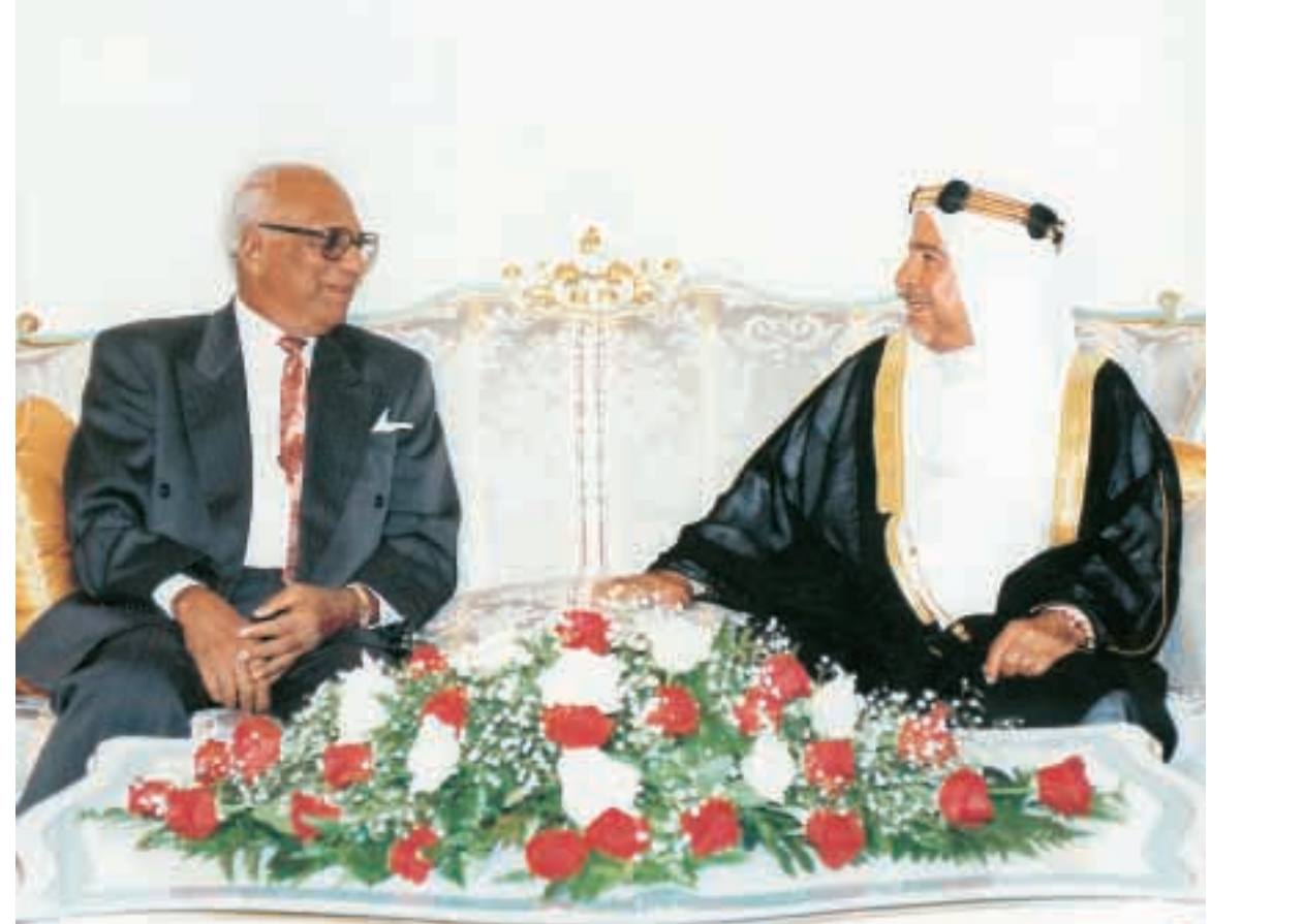
With the Emir of Kuwait (above) and the Emir of Bahrain in November 1996 (below).