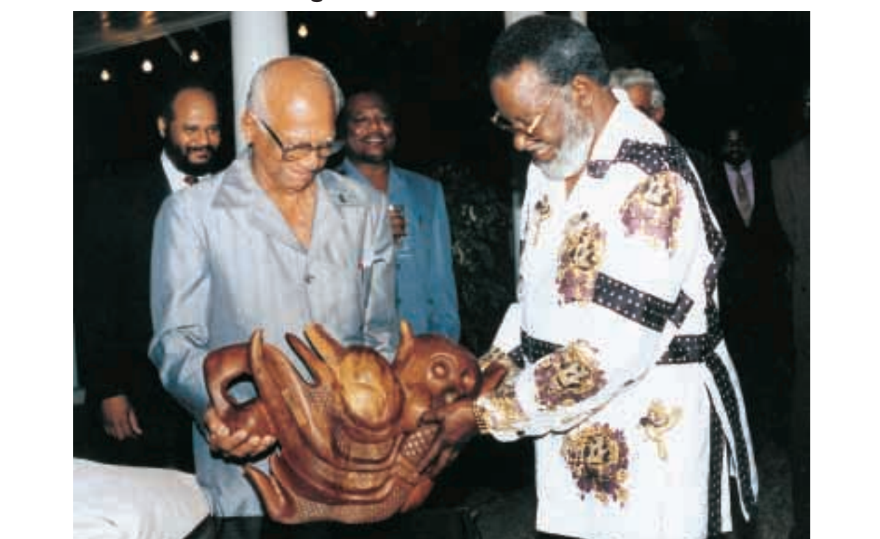
With President Sam Nujomo of Namibia.